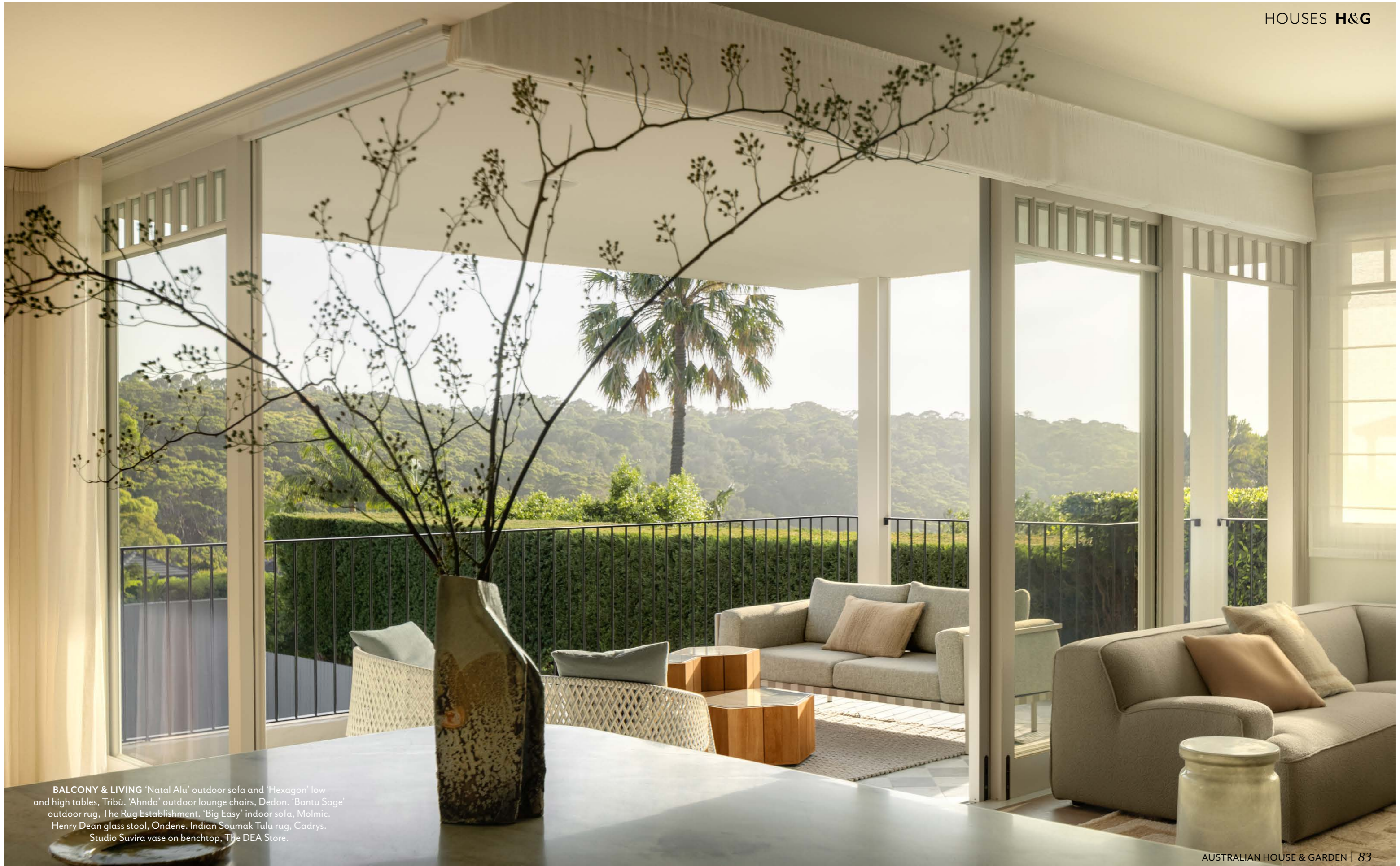
BALCONY & LIVING 'Natal Alu' outdoor sofa and 'Hexagon' low and high tables, Tribù. 'Ahnda' outdoor lounge chairs, Dedon. 'Bantu Sage' outdoor rug, The Rug Establishment. 'Big Easy' indoor sofa, Molmic. Henry Dean glass stool, Ondene. Indian Soumak Tulu rug, Cadrys. Studio Suvira vase on benchtop, The DEA Store.